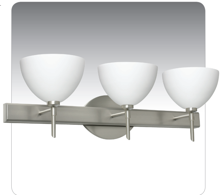
BRELLA SHOWN IN WHITE (467907)

UL or ETL Listed. Suitable for Damp Locations (interior use only).